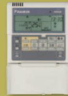
BRC1D52 Wired remote control (standard)