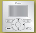
BRC1E51A Wired remote control (optional)