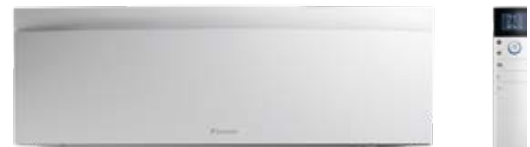
Matt crystal white

Struggling with Hayfever or dust allergies? Harnessing active ionisation to break down organic particles like pollen, dust, fungi, bacteria and viruses, Emura can help you beat the allergy season.